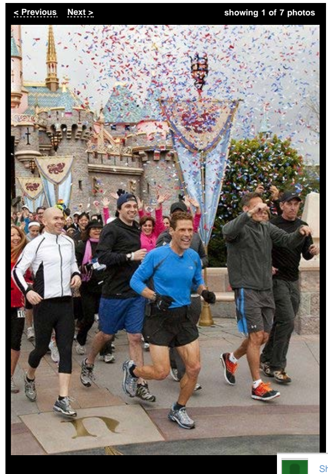
In this Feb. 25, 2011 publicity image released by Disneyland, mega-marathoner Dean Karnazes, center, starts out his 3,000-mile run across the country at Disneyland park in Anaheim, Calif. Karnazes has crossed the finish line in New York after his coast-to-coast run.

— an average of 40 to 50 miles run daily (from eight to 15