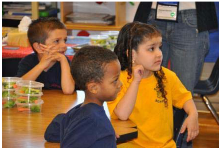
Chopin students prepare for vegetable taste tests